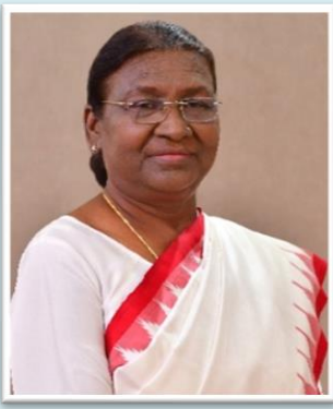
Visitor Smt. Droupadi Murmu, Hon'ble President of India