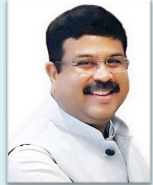
Shri Dharmendra Pradhan Hon'ble Education Minister