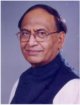
Chancellor Dr. C. P. Thakur