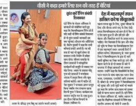
संस्कृति के अंग के रूप में बिहू नृत्य का प्रदर्शन...

परिचय समारोह में छात्राओं ने असम के प्रसिद्ध नृत्य बिहू का किया प्रदर्शन