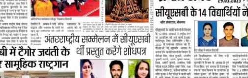
12 विद्यार्थियों को गेट 2023 में मिली सफलता।

पटना, रविवार, 10 अक्टूबर 2023 पटना, 10 अक्टूबर: 12 विद्यार्थियों को गेट 2023 में मिली सफलता।