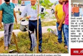
वैश्विक जलवायु परिवर्तन के कारण पेड़ों की संख्या घट रही है, जो जलवायु परिवर्तन के साथ जीवों पर पड़ रहा असर है।

पेड़ों की घटती संख्या से जलवायु परिवर्तन के साथ जीवों पर पड़ रहा असर : वीसी