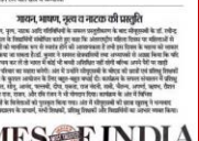
सीयूसबी स्वयंसेवकों के लिए अंतर्राष्ट्रीय कार्यक्रम का आयोजन।

सीयूसबी स्वयंसेवकों के लिए अंतर्राष्ट्रीय कार्यक्रम का आयोजन