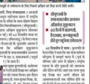
एकता का संदेश लेकर साइकिल यात्रा पर निकले।