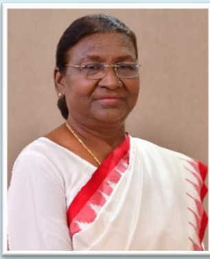
Visitor Smt. Droupadi Murmu, Hon'ble President of India