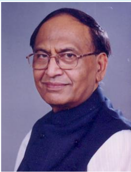
Chancellor Dr. C. P. Thakur