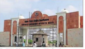
The CUSB building at Pancharpur, 12 km from Gaya.

Hindustan Times MONDAY PATNA JUNE 12, 2023