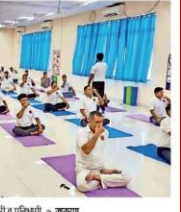
प्रतिदिन योग से रह सकते हैं स्वस्थ : कुलपति।

प्रतिदिन योग से रह सकते हैं स्वस्थ : कुलपति