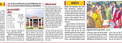
सीयूसबी स्वयंसेवकों के लिए अंतर्राष्ट्रीय कार्यक्रम का आयोजन।

सीयूसबी स्वयंसेवकों के लिए अंतर्राष्ट्रीय कार्यक्रम का आयोजन