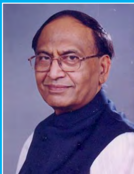
Chancellor Dr. C. P. Thakur